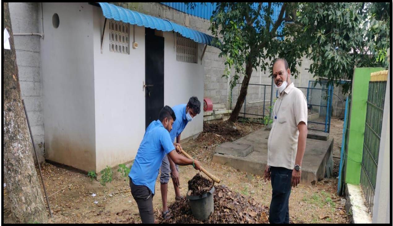
Vermi -Compost Pit - Maintenance